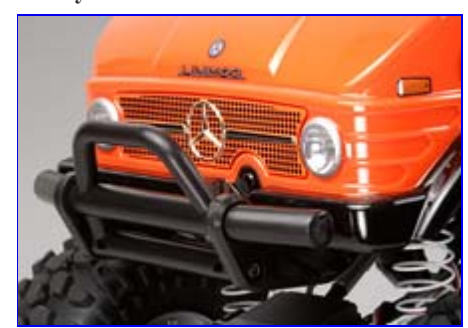
The body captures the humorous form of the Unimog. Metal plated front grille and emblem enhance the realism.