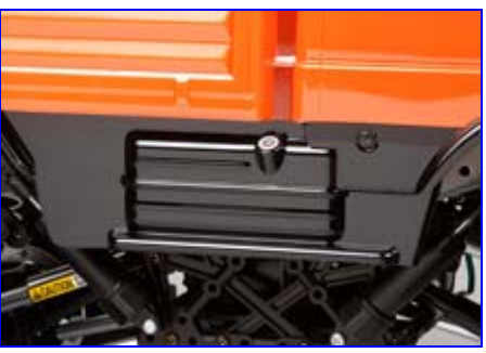
Separated polycarbonate parts reproduce the details such as a fuel tank under the cargo bay.