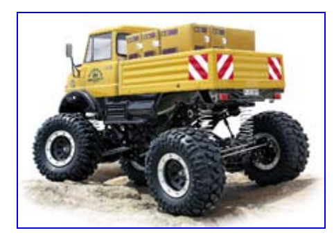
Inside the kits box are 1/10 scale printed drawings of carton boxes allowing you to make and load on the cargo bay.

Specifications •Length: 435mm •Width: 265mm •Height: 280mm •Weight: 2325g •Wheelbase: 288mm •Tread: (Front/Rear) 208mm •Tire Width/Diameter: (Front/Rear) 57/125mm •Chassis: Ladder frame with aluminum side channels and resin cross members • Drivetrain: Shaft-driven 4WD • Diff Gear: 3-bevel diff (standard: locked setting) • Planetary Gearbox • Suspension: Front/Rear 4-link rigid • Front/Rear CVA oil dampers • Gear Ratio: 1:40.5 • Electronic Speed Controller (separately required) •RS540 Type Motor