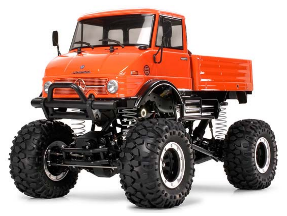
Length: 435mm (Image shows painted and assembled model)

This is a 1/10 scale R/C assembly Rock Crawler machine of the Mercedes-Benz Unimog which has been a long-seller truck among its series since its debut in 1963. The humorous form of its curved hood with round headlights is realistically reproduced by a durable polycarbonate body shell. The Rock Crawling CR-01 chassis features superior off-road performance and is equipped with a durable ladder frame, aluminum side channels and resin cross members, 4-link suspension with aluminum rods and oil dampers, and a shaft driven 4WD with lockable differentials. Also comes with realistic rubber tires with side wall tread patterns and the beadlock wheels. This machine will surely bring you a great enjoyment in conquering difficult rocky terrain.